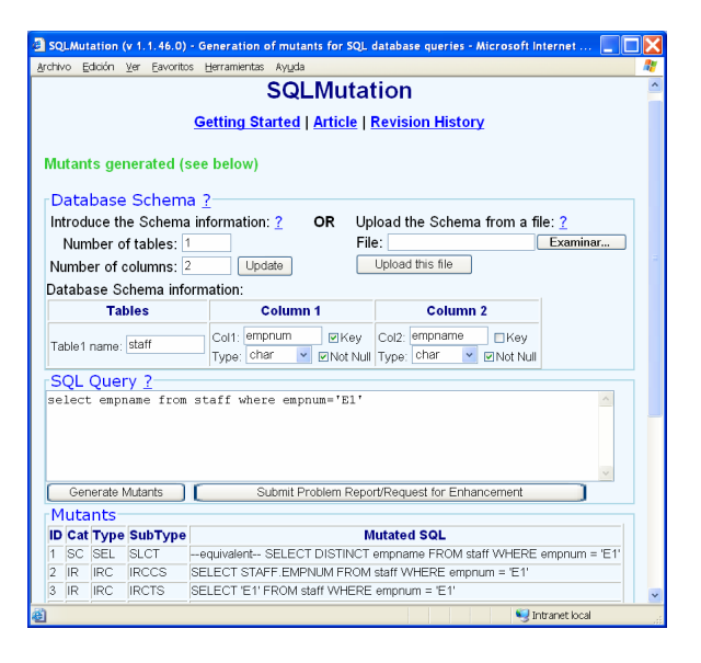
Figure 2. Main Screen (Web interface)

In the following subsections each of the components is described in more detail.