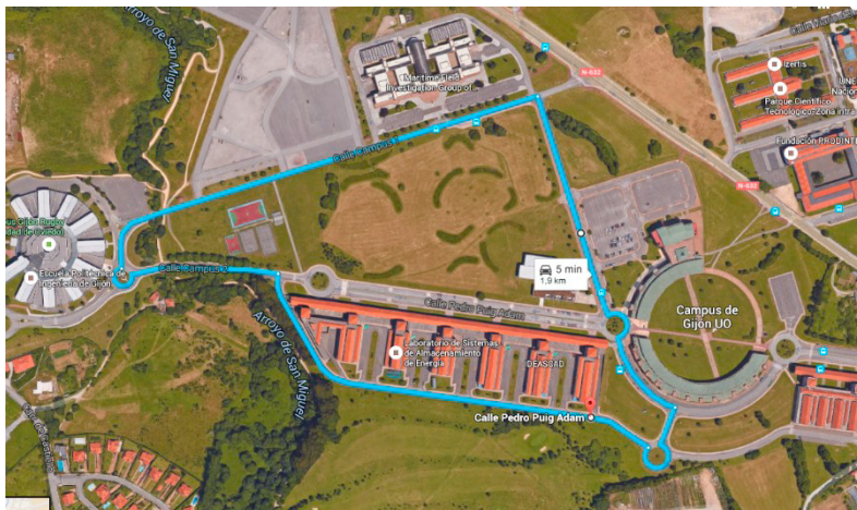
Fig. 2. Example of one of the routes used for validating the electric vehicle model