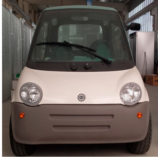
Fig. 1. Bombardier NV-2000 Sport-E Electric Vehicle