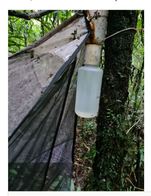
Figure 3. doi Ethanol > 90% recipient to preserved specimens from our fieldwork.

Step description: Most specimens deposited in collections were preserved in entomological drawers under dry conditions. The information contained on the specimens' labels was collected to build the dataset. Specimens from our fieldwork are preserved in ethanol > 90% since the date of collection (Fig. 3), which better preserves soft-bodied insects, such as fireflies and also prevents DNA degradation.