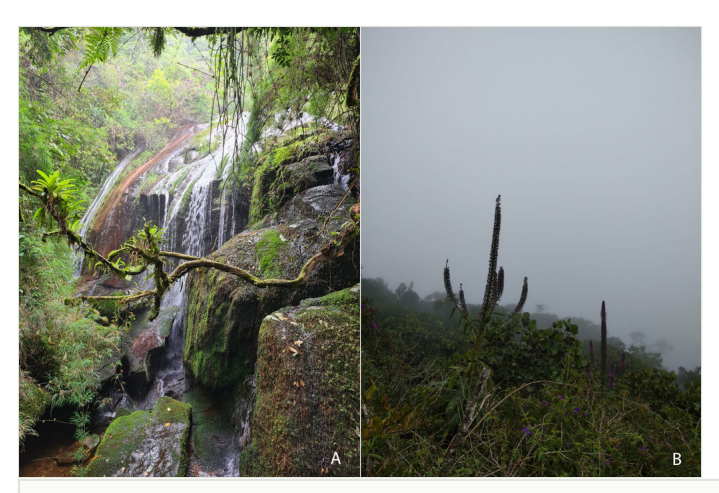
Figure 4. doi

Description: The samples were collected from different areas throughout the Brazilian Atlantic Forest (Fig. 4). The data obtained from entomological collections was georeferenced by using the information in specimens' labels stored in appropriate drawers or jars.