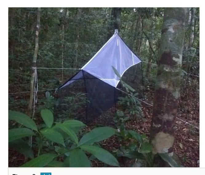
Figure 2. doi Typical Malaise trap in the Atlantic Forest.

The surveys at Parque Nacional da Serra dos Órgãos, Parque Nacional da Tijuca, Parque Estadual da Pedra Branca and Parque Estadual da Ilha Grande were conducted following the same protocol. We used Malaise traps (Fig. 2) and active search across all habitat types and seasons, to enhance the coverage and completeness of our sampling effort. This fieldwork methodology (Suppl. material 1) increased the overall success of the surveys (see Silveira et al. (2020)).